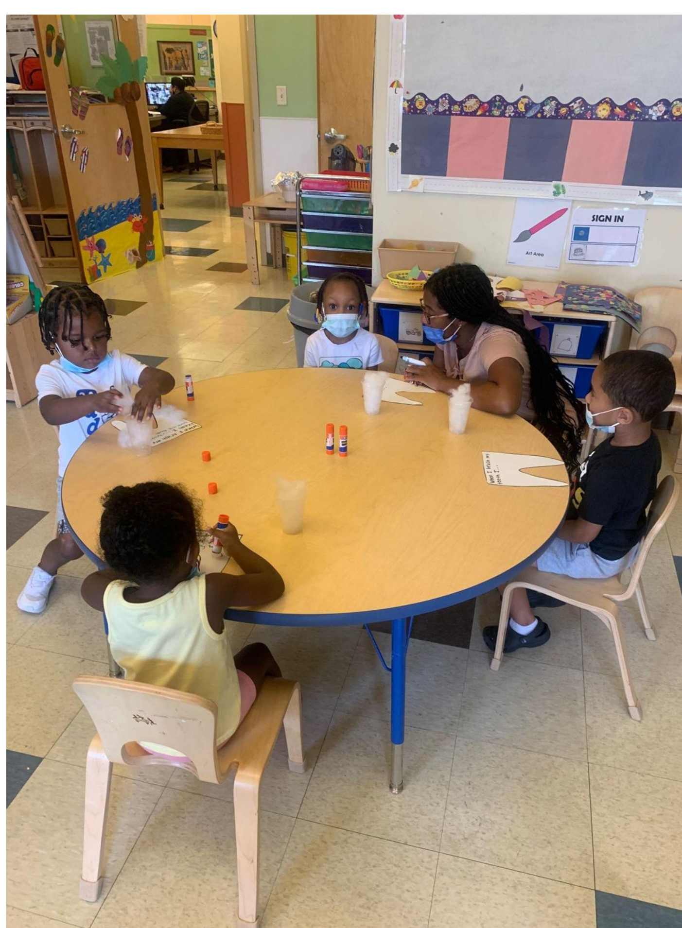
Learning about brushing teeth!

This summer, we worked both in the adult day program and the summer camp. We worked both with older adults and young children. With the older adults we focused on providing activities that stimulated the mind and excited the participants in the program. This consisted of puzzles, games, and clay art projects. In the summer camp program, we each assisted in a classroom and helped facilitate daily activities. This consisted of handwriting lessons, playtime, exercise, reading, and sometimes field trips around the community. Additionally, we both developed programs to teach the campers in our classes about oral health.